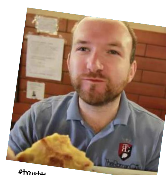
#trusttheexpert #andiamo #pi33a #eatyourheartout #dontholdback #eatlikealocal #firsthandexperience #stuffyourface #italianfoodporn