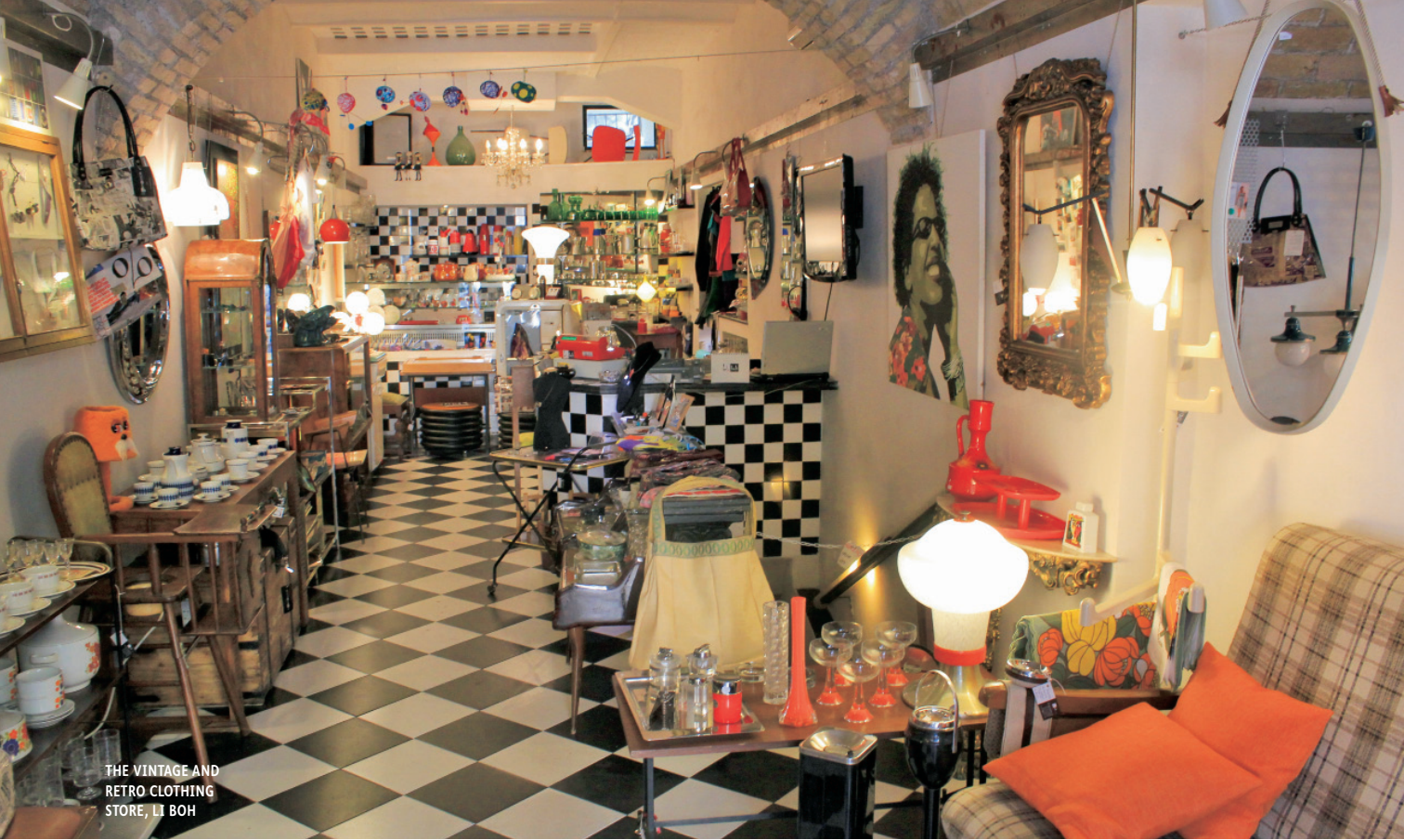
THE VINTAGE AND RETRO CLOTHING STORE, LI BOH