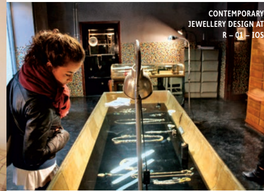
CONTEMPORARY JEWELLERY DESIGN AT R - 01 - IOS