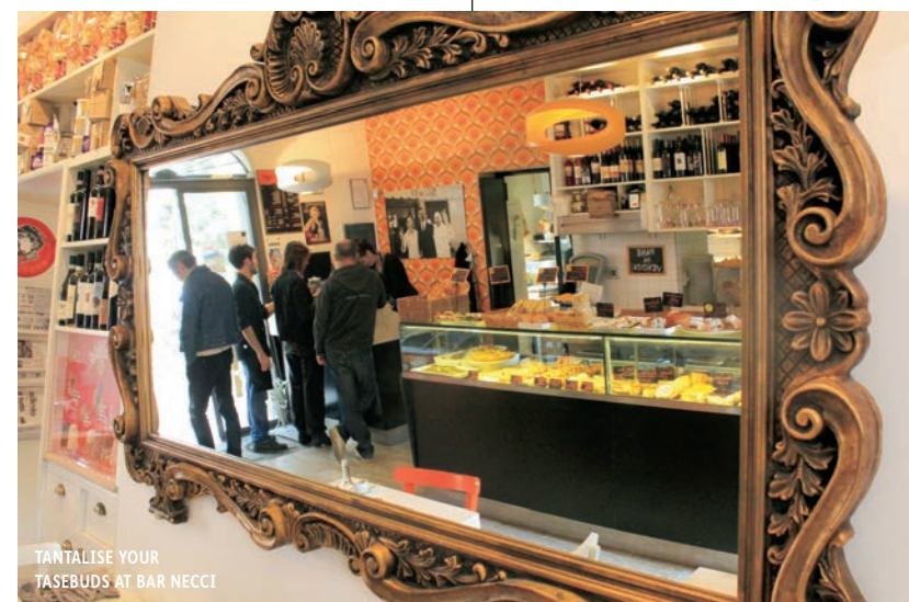
TANTALISE YOUR TASEBUDS AT BAR NECCI